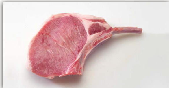
Durham Ranch Berkshire Pork 8 Bone Rack and Chop